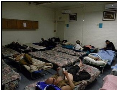
Typical mission setting

His addiction began early in life when, at 19, a serious car accident left him with a broken neck and back. He was prescribed Percocet for five years and developed an addiction that continued until recently. He also suffers from anxiety and depression.